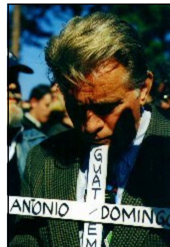
Actor Martin Sheen participates in the annual School of the Americas protest in Fort Benning, Georgia, organized by SOA Watch.