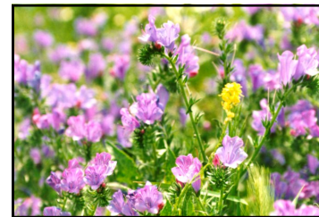
A St. Olaf Peace Garden will be installed between the Buntrock Commons and Boe Memorial Chapel during Spring 2004.