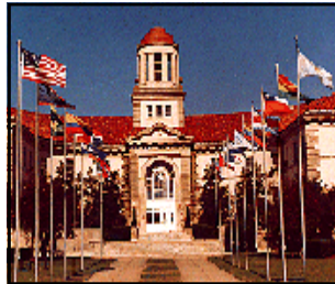
The exterior of the controversial Western Hemisphere Institute for Security Cooperation, formerly known as the School of the Americas, at Fort Benning, Ga.

Wait a minute. Why would our government support such an institution? In light of the on-going war against terrorism, how could U.S. leaders be handing out money to an organization that creates the very evil we are fighting? A short history will help answer these questions.